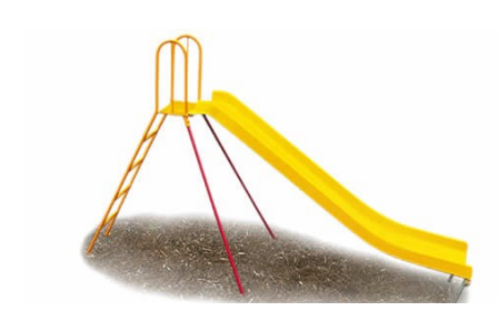
2.4m long Fibreglass slide (1.2m high) And Galvanised ladder ......... $1200.00 Powder coated Ladder is an extra $ 200.00

Cell Foam Swing seat only $172.50 Slide ladder –Galv......$330.00 p/c $530.00 2.4m long fibreglass slide chute .. $950.00 1.2mH 2.7m long fibreglass slide chute .. $1720.00 1.5mH